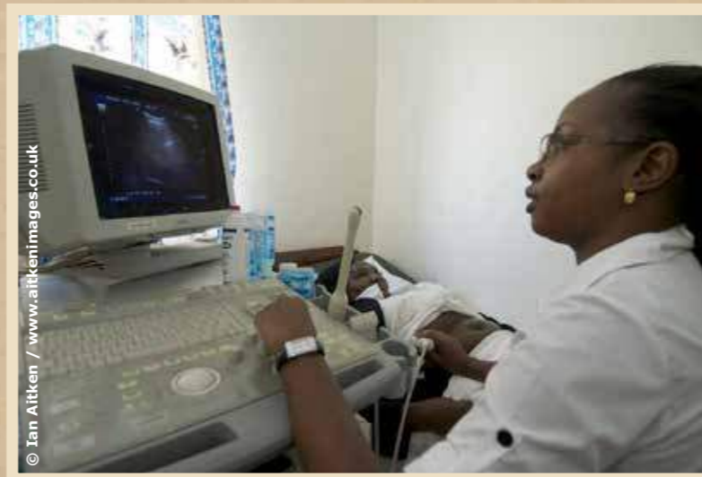
The ultrasound machine donated by OI Pejeta in use at the Nanyuki District Hospital

On December 14 th , 2011, the OI Pejeta Conservancy donated 131 boxes of assorted medical equipment to Nanyuki District Hospital thanks to the Burnaby Hospital in Canada. This donation included gloves, disposable thermometers, oxygen saturation machines, four hospital beds, two mattresses and an examination couch.