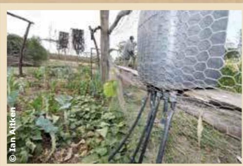
A drip irrigation kit