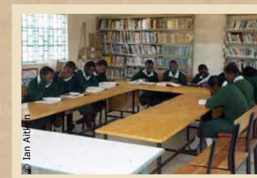
Sweetwaters Secondary School is one of the schools supported by OI Pejeta