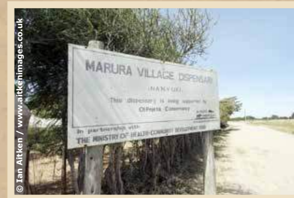
The OI Pejeta Conservancy supports a number of community dispensaries

The OI Pejeta Conservancy is committed to improving the health status of neighbouring communities. We allow free treatment of locals at our Kamok Dispensary, contribute to building additional community dispensaries and also donate medical equipment for use in local hospitals. Even so, we realize that access to proper healthcare for rural communities is often limited or non-existent and therefore in collaboration with the Ministry of Health initiated a community health outreach programme in May 2011.